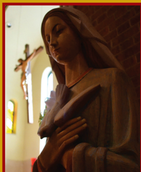
Home away from home