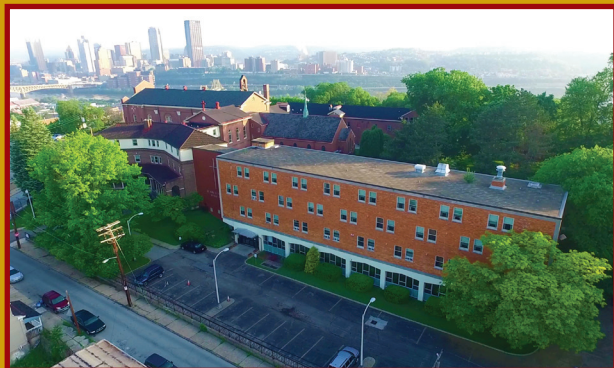
A quiet place for spiritual renewal